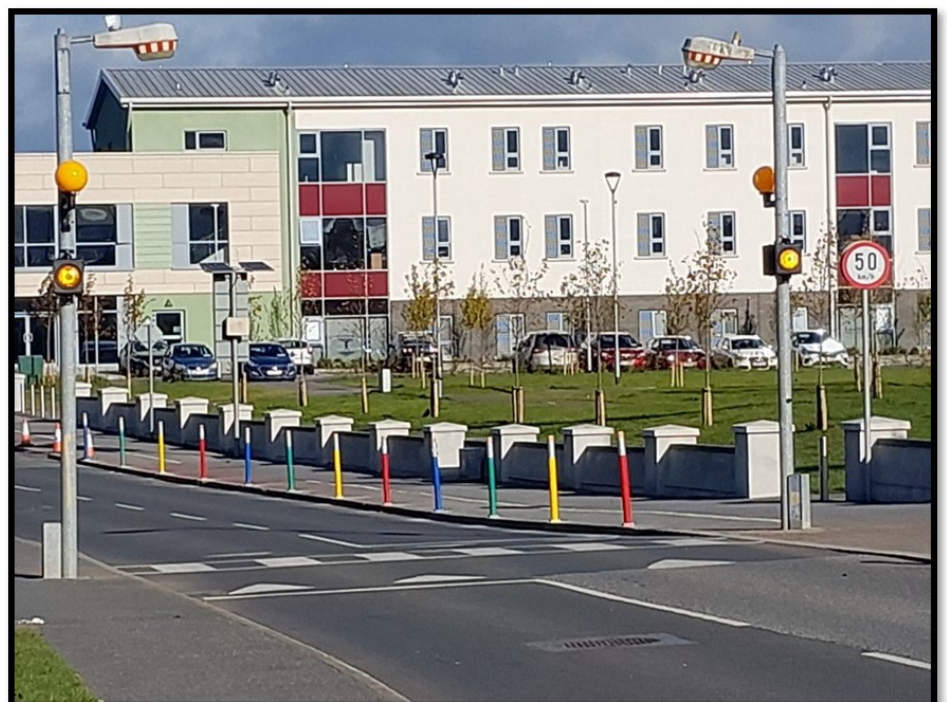
Ballybought Street Pencil Bollards