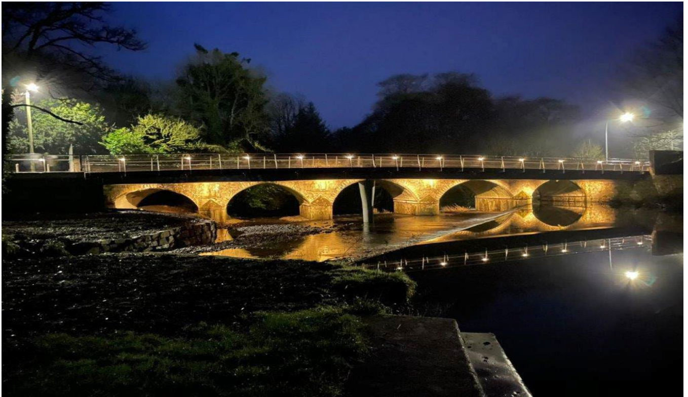
New Pedestrian Bridge in Castlecomer

The following is a list of actions to be undertaken by Kilkenny County Council in relation to safe and healthy modes of travel: