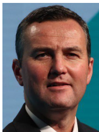
Sam Waide, CEO, Road Safety Authority

Ireland has made significant progress over the lifetime of previous road safety strategies. Since the launch of the first ever Road Safety Strategy in 1998, road deaths have declined by almost 70%. None of that progress could have been possible without our key stakeholders working together in a coordinated, strategic way.