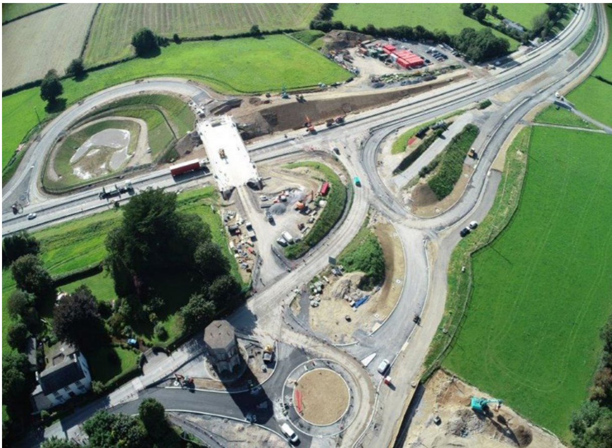
Overhead View of the Tower Road Project