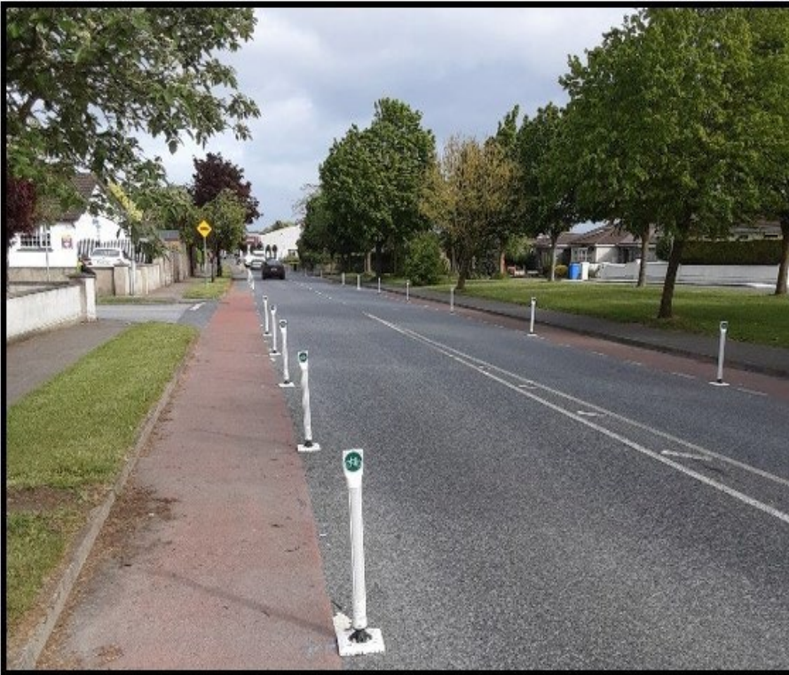
Bohernatounish Road Cycle Infrastructure