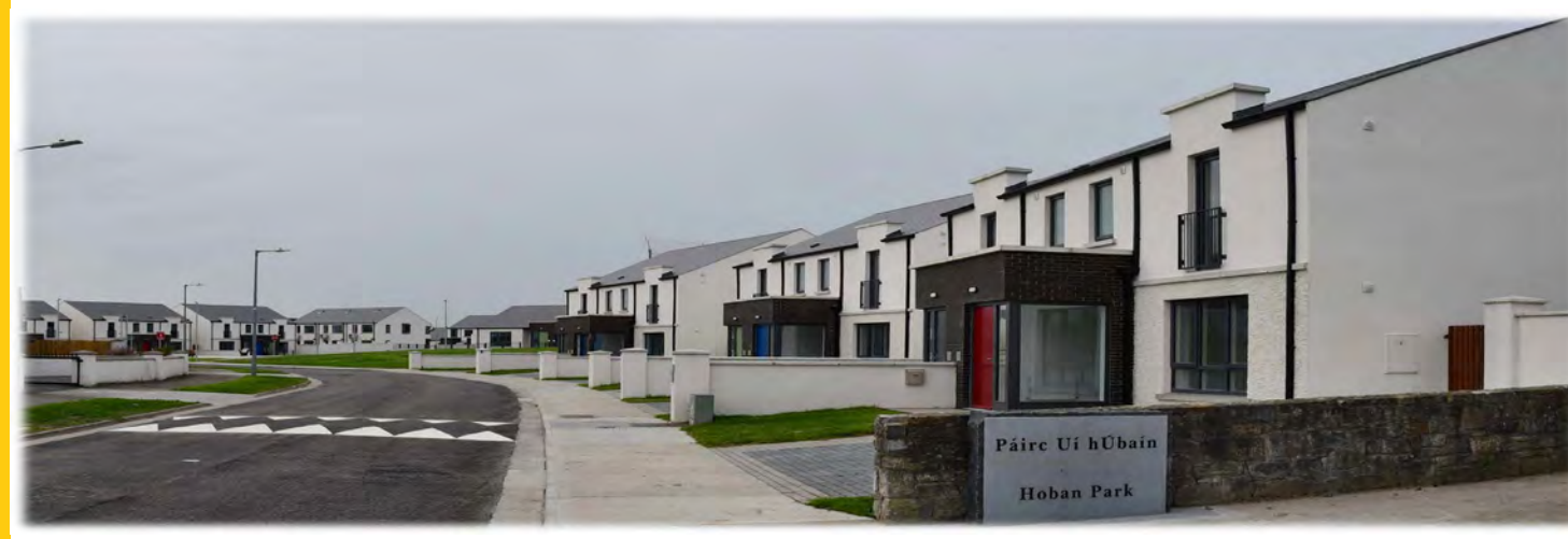
First Near Zero Energy Development in the entire Country at Hoban Park, Callan, Co. Kilkenny

Housing development at Pennefeather Green, Kilkenny City.