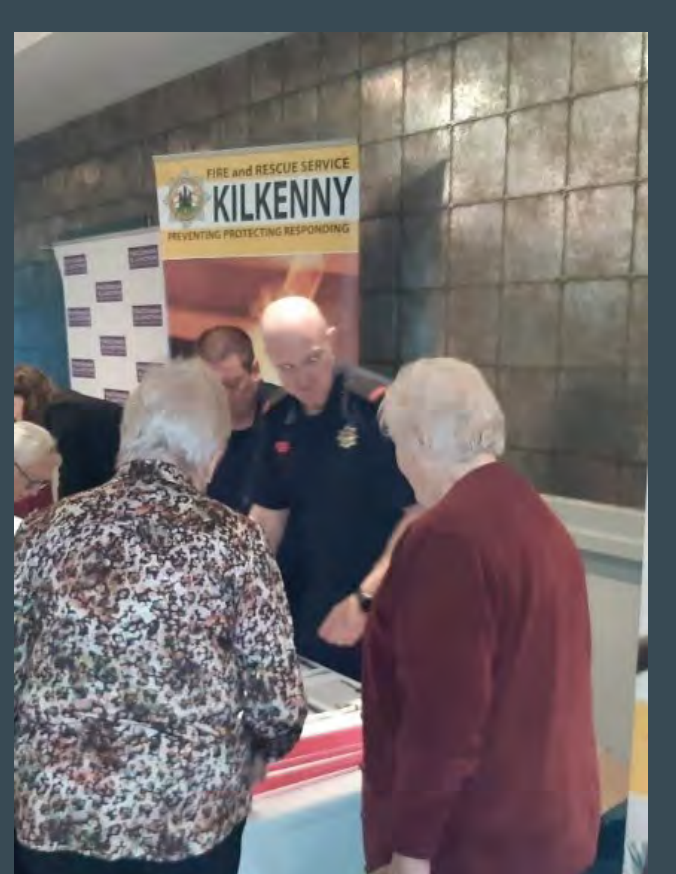
Fire personnel giving fire safety advice at the Kilkenny Older People's Counci celebration in the Kilkenny Ormonde Hotel.