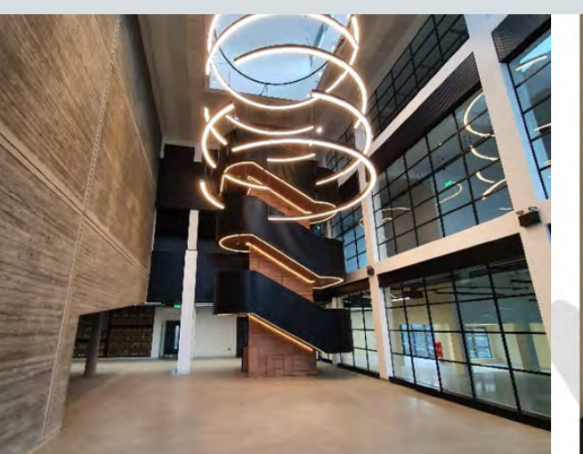
The Atrium at the newly renovated Brewhouse Building at Abbey Quarter, Kilkenny Cit

Works to Horse Barrack Lane and the Brewhouse Courtyard, which provide access to the Brewhouse Building, have been completed, with the area immediately adjoining the new Mayfair Library building to be completed with the new library works.