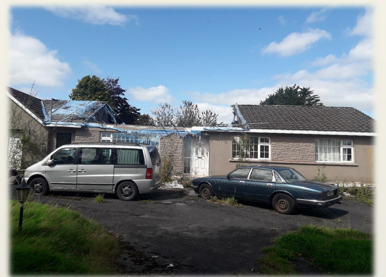
Seanna Place, Lr. Kilmacow