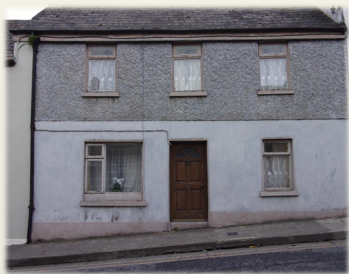
10 Blackmill Street