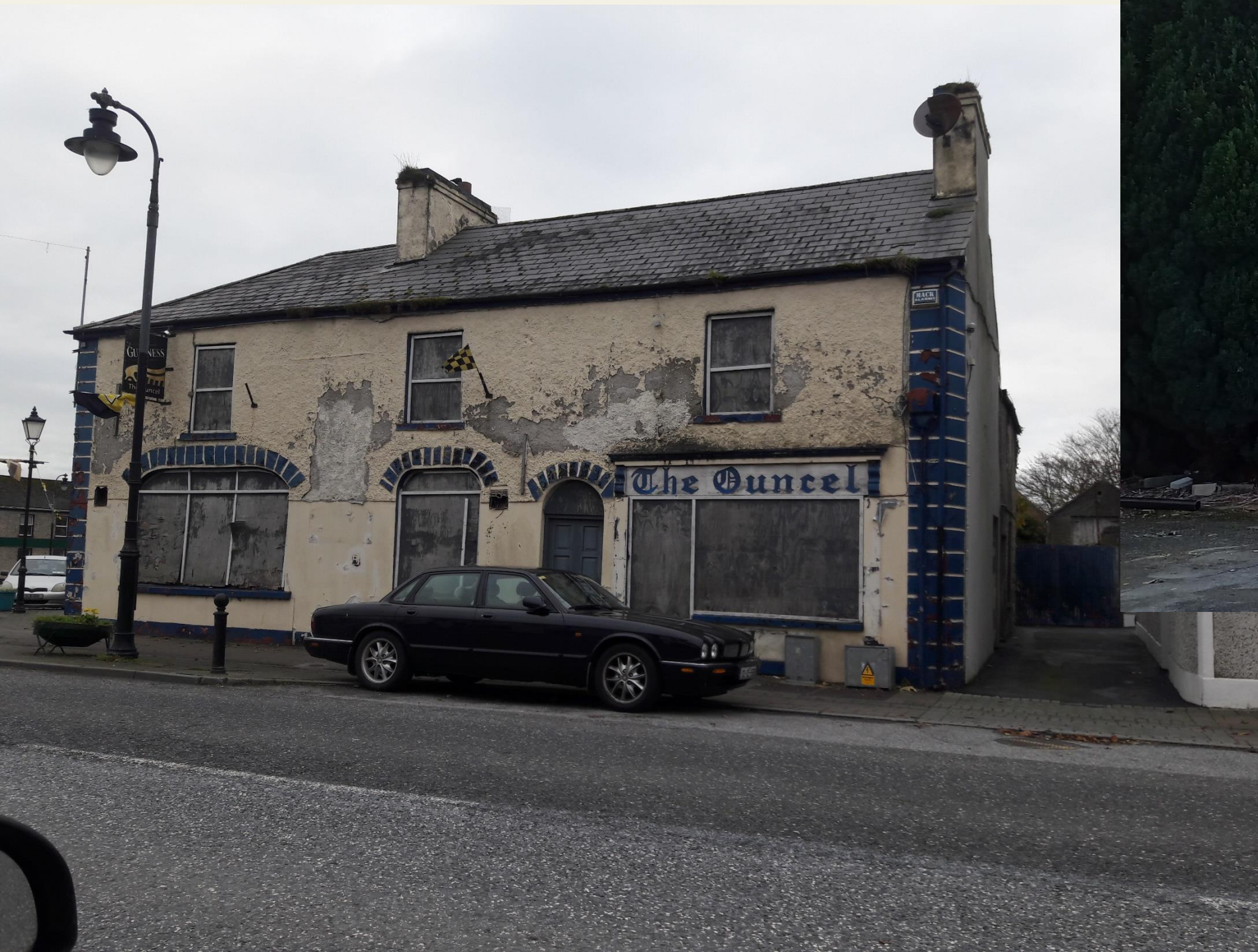
R & L The Ouncel, Johnstown