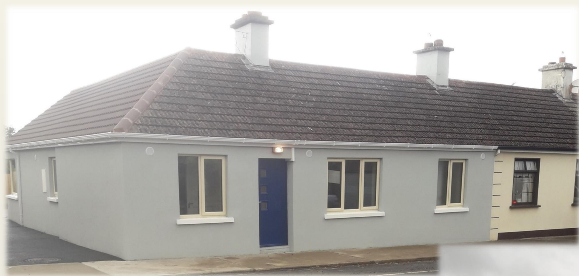
Kilmoganny Village B & R accessible family home