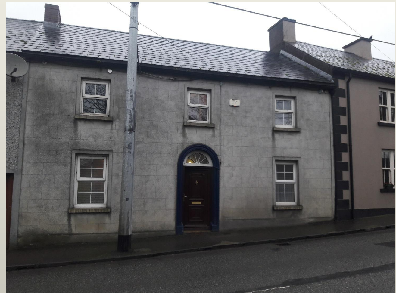
B & R Main St., Gowran