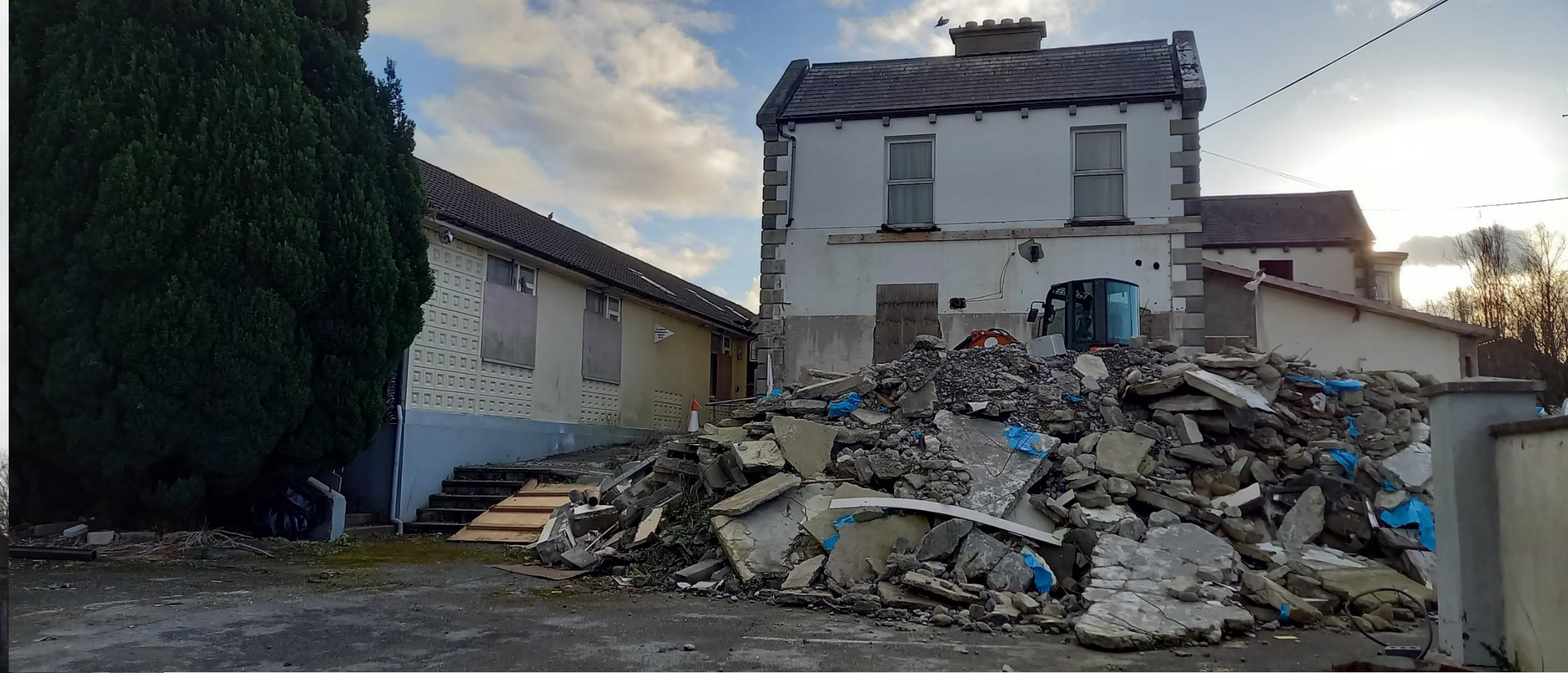
R & L Avondale, West St., Callan