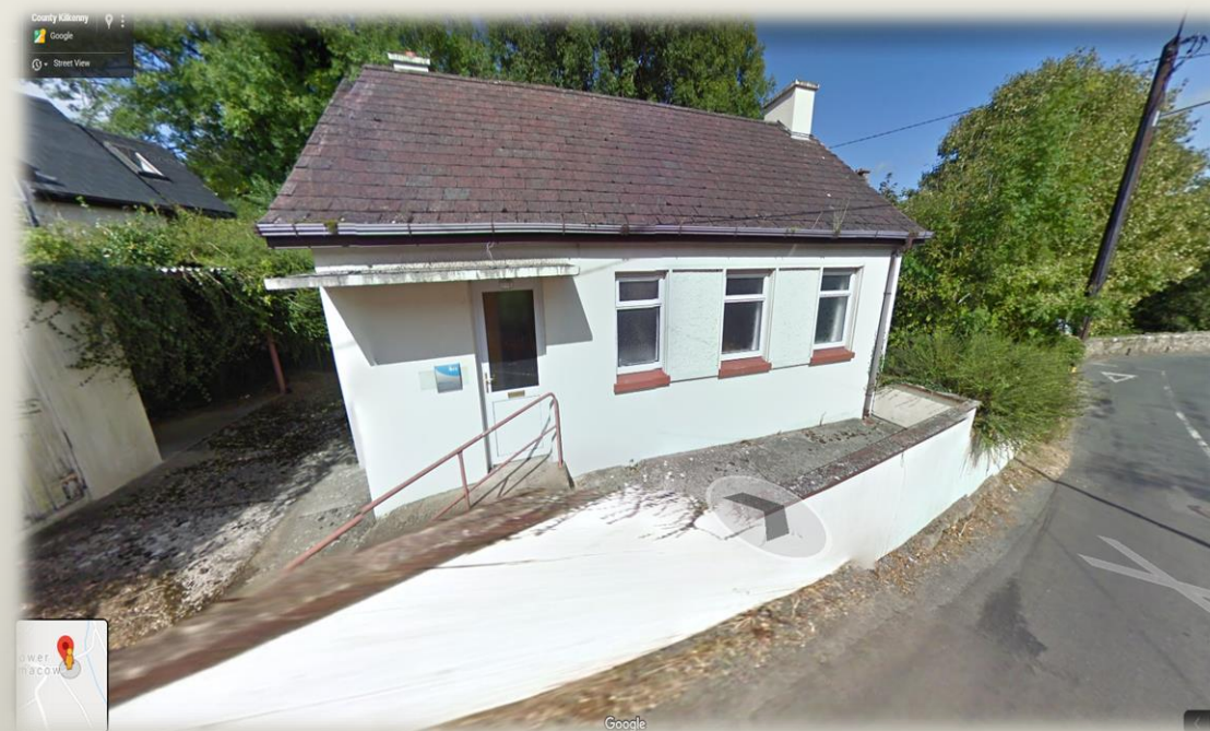
Old Health Centre, Kilmacow