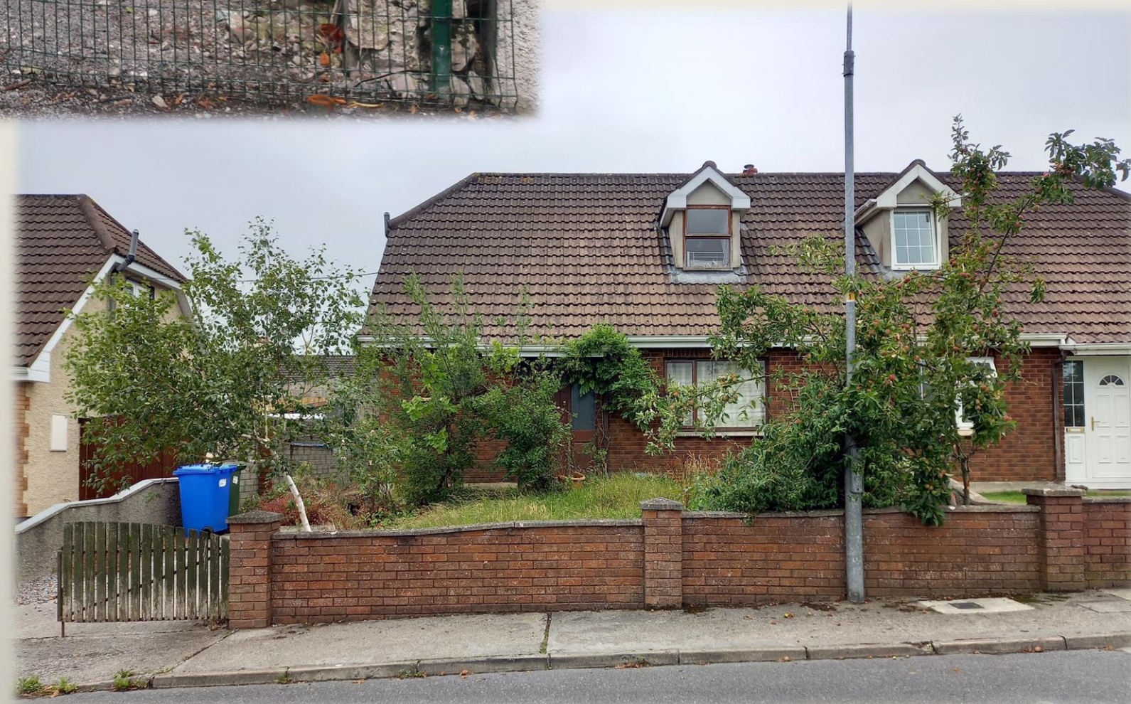
58 Westfield. Kilkenny