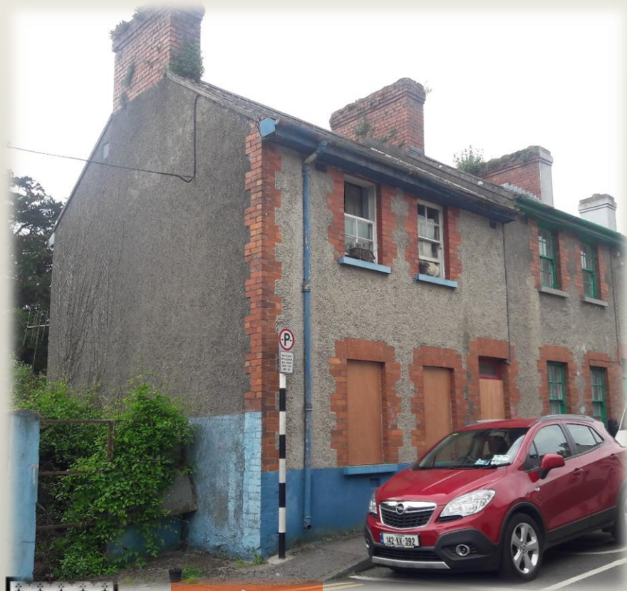
60 Maudlin St.