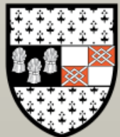
77 Maudlin Street, Kilkenny