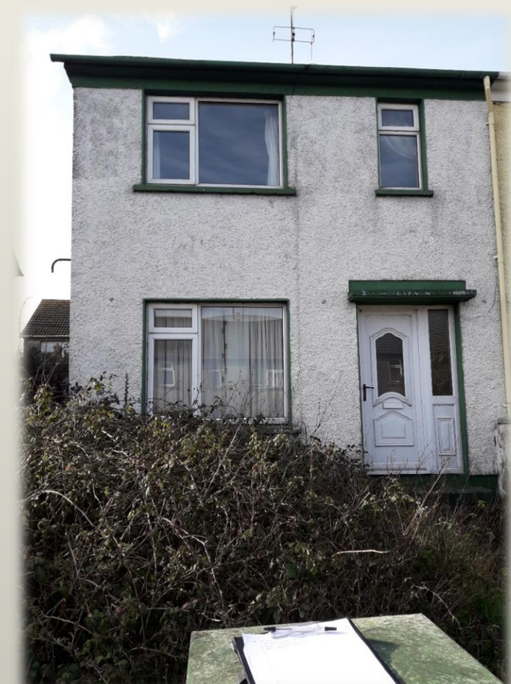
19 Suir Crescent, Mooncoin