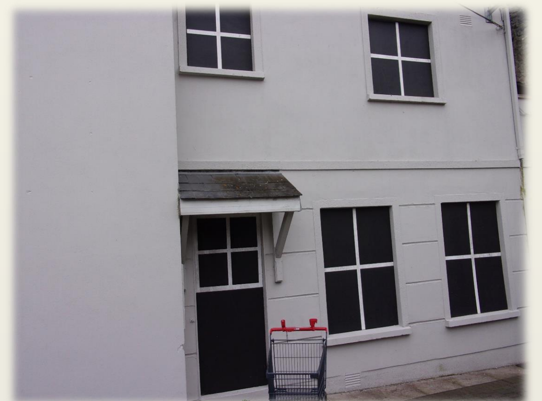
11 Tilbury Place, Kilkenny