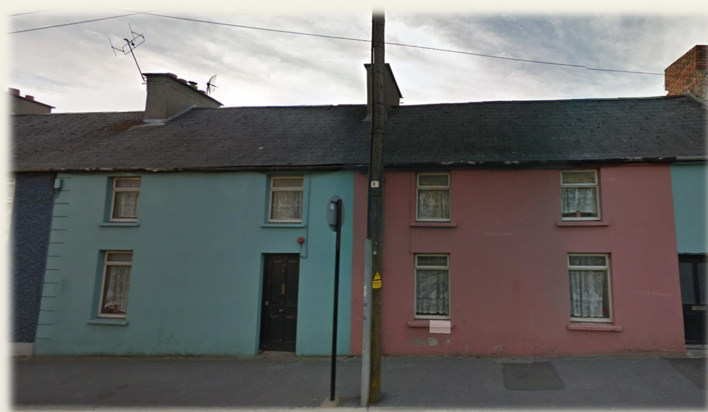
6/7 Upper Patrick Street